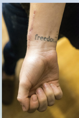
Next to track marks, Katie H. wears a tattoo which represents her goal to break free from drugs.